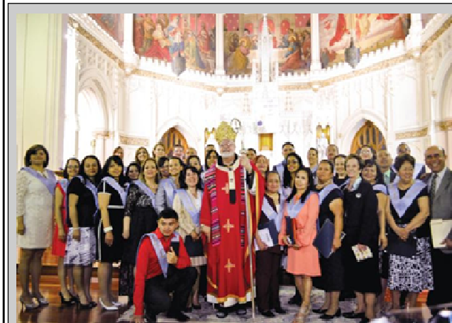
The cardinal visited our parish to celebrate Mass and congratulate 34 from the Archdiocese that received certificates from the Religious Ed Office. 11 of these where from our Parish.